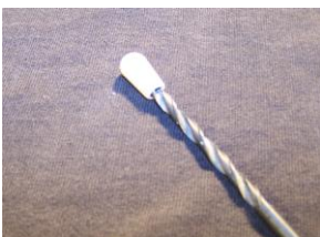
Fig. 6 Open up your switch cap to fit your new switch.