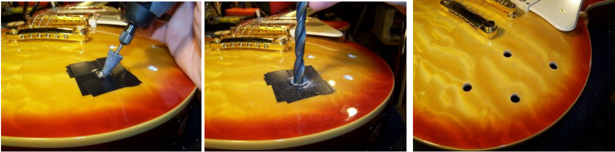
Fig. 2 Widen the top of the hole Fig. 3 3/8 drill bit by hand to finish Fig. 4 Patience will bring good results