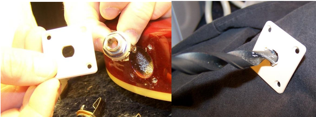
Fig. 5 Open up the jack plate so that the new jack will fit through it.